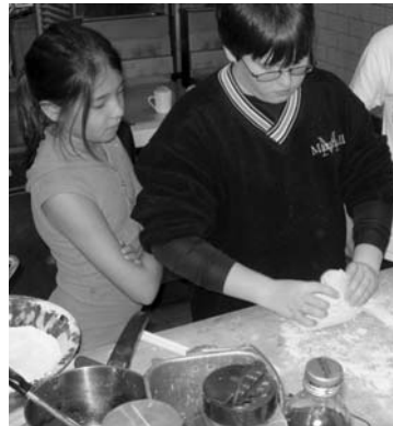
Cooking up a storm during the Americorp after school program