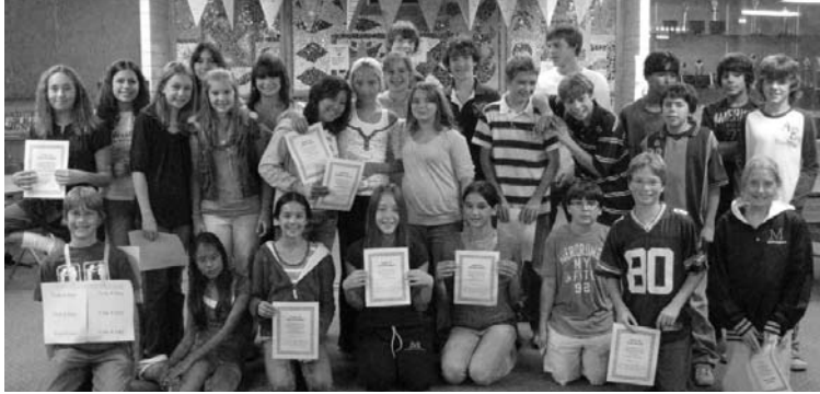
Middle school student council campaign participants