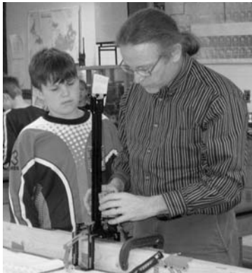
Teacher and student collaborate on robot challenge