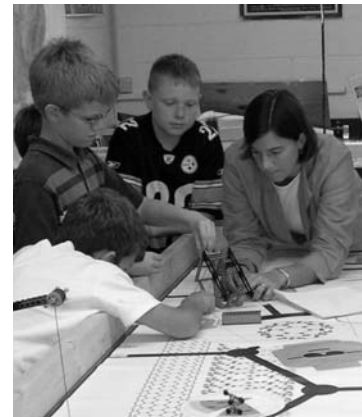
Testing robots for lego league